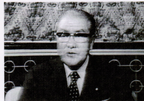
Prime Minister Pinto Balsemao, Portugal

"Men of goodwill throughout the world deplore the present situation in Poland and...search for an avenue which leads to genuine stability and prosperity in Poland."