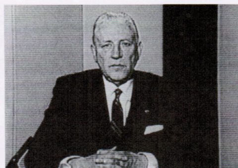
Prime Minister Zenko Suzuki, Japan

"I would like to add my voice to those leaders of other countries to ask the military authorities... to abolish the state of martial law which currently suppresses the most profound aspirations of the Polish people."