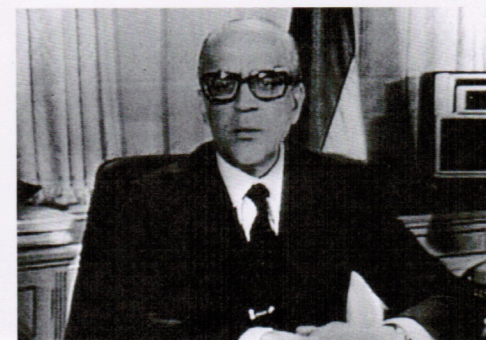
Prime Minister Pierre Werner, Luxembourg

"I am convinced that all democratic nations must show an attitude of unity and firmness in the face of the Polish crisis and the Soviet responsibilities related to it."